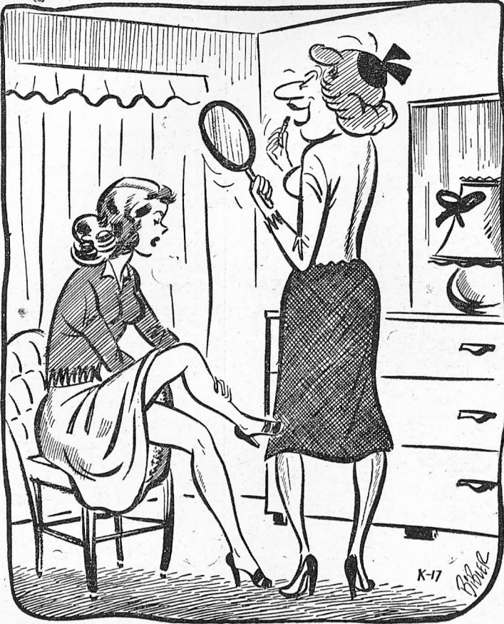
"I must tell a convincing story—I told him my father owns a big horse ranch."