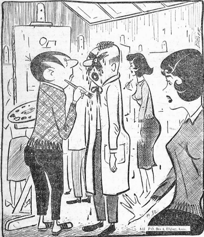
"AND THE SECOND THING YOU SHOULD LEARN TO DO IS TO TAKE CRITICISM"