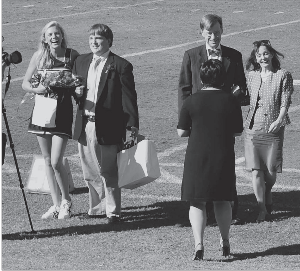
Gwen Weil/The Sou'wester