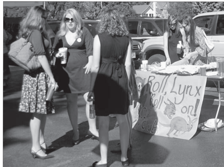
Students enjoy tailgating before the homecoming football game against Austin College. Student organizations created banners and cheers to support the Lynx.