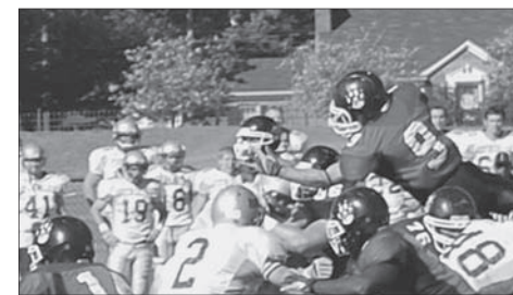
Football wins! Football wins!

The Weekly Student Newspaper of Rhodes College