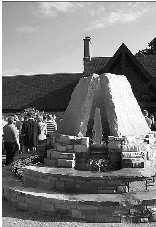
Garner Court dedication