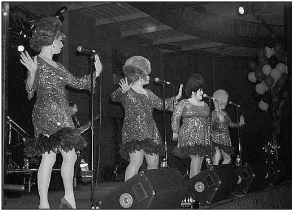
The Bouffants: "The higher your hair, the closer to God".