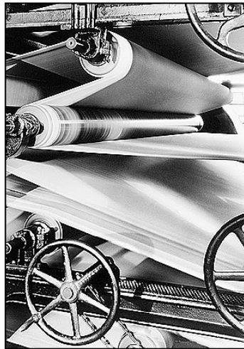
Margaret Bourke-White, International Paper, gelatin silver print, 1937

Bourke-White's images capture the many forms of power harnessed by the paper