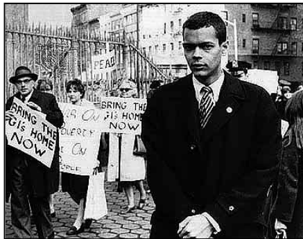
Bond at a peace rally in New York City, 1966

During his service in the Georgia General Assembly, Bond sponsored or cosponsored more than 60 bills that became law. He waged a successful fight in the legislature and courts to create a majority black congressional district in Atlanta and organized the Georgia Legislative Black Caucus. Bond was founder and