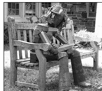
Val Valgardson's sculpture students were assigned to build themselves out of cardboard. This figure sits in deep thought near Harris Alumni Lodge.