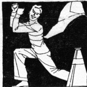
Special to the Ole Miss Special. Links Katz Defeat Ole Miss. Score 105 to 3.