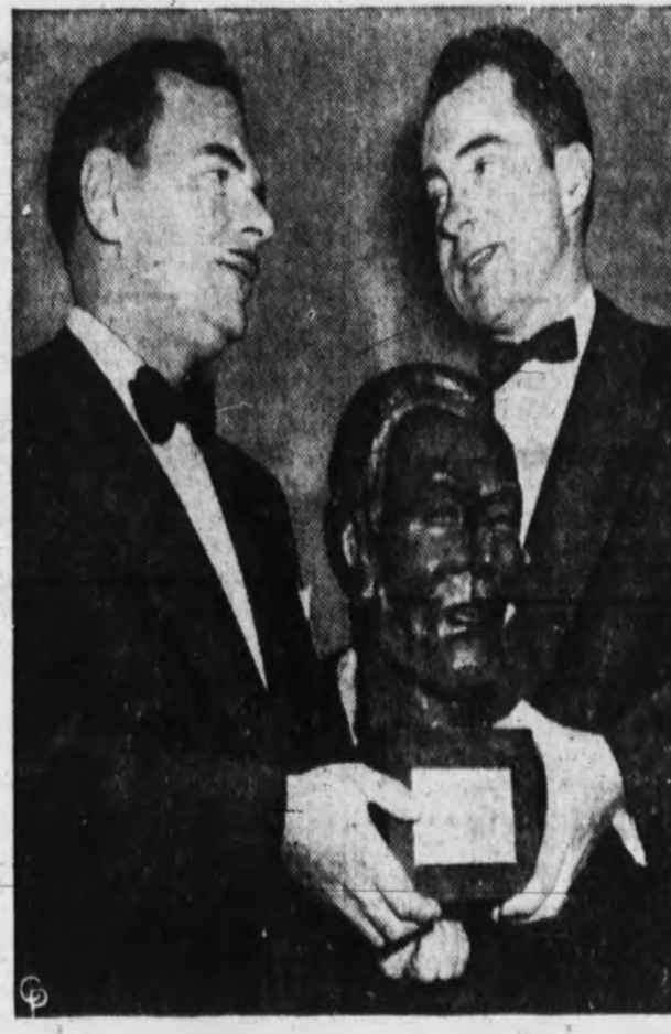
FORMER GOVERNOR Thomas E. Dewey (left) of New York presents a bronze head of Abraham Lincoln to Vice President Richard M. Nixon at the National Republican Club's 70th annual Lincoln Day Dinner in New York. Dewey received the first and similar award at last year's affair. Nixon told the 1,800 GOP diners that if the Eisenhower program failed to triumph in this year's election, the only alternative would be "something more radical."