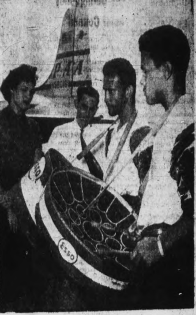
STEEL BANDS ARE TRADEMARK OF TRINIDAD — Trinidad is the home of the famous steel bands, and PAA visitors discover this as soon as they embark from their Clipper at Piarco airport, Port of Spain, for the booming notes of the unusual bands are a strange welcome. The instruments, called "pans", are made from old 55-gallon oil drums and are tuned with a hammer and cold chisel. They are played with rubber headed, drumsticks, polo. —