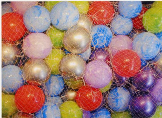
filaments and voids, plastic balls, string netting and zip ties, 2002

I pour paint into molds and watch it dry. Sometimes I do other things while it dries. I repeat this effort until it is done. This process is done when the mold has been filled completely. I remove the paint from the mold and place it wherever it needs to be placed. The placement is based upon the space for which the piece has been made. I make these objects to fulfill a need for purpose. I'm done.