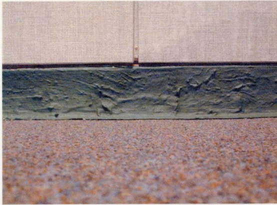
Baseboard Fitting, acrylic latex 2002