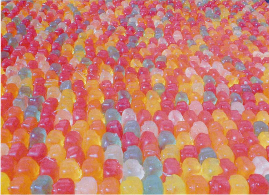
Sugar-coated, marshmallows, Gummi Bears, hot glue, and resin. 2002.