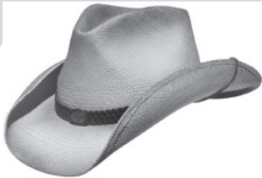
Wearing ten-gallon hats shows your solidarity with Lone Star Staters in their uphill battle for acceptance.

While Texans, or Texo-Americans, are well represented at Rhodes, the fact remains that natives of Texas are a distinct regional minority among the vast majority of Rhodes students who originate from the remainder of planet Earth. As such, this group is vulnerable to the stereotyping and discrimination that plague other disenfranchised populations. I myself am immune to such prejudice since some of my best friends are from Texas. Nevertheless, the fight against bigotry requires a sustained effort, which is why I have proposed each March 21 (the anniversary of the "Who Shot J.R.?" episode of Dallas ) be observed