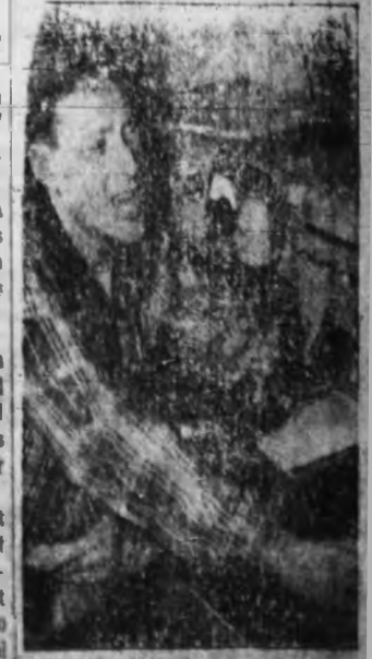
DEWEY PHILLIPS (Tell 'em Phillips Sent You)