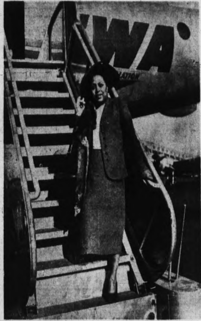
FIRST NEGRO DELEGATE TO U. N. ARRIVES - NEW YORK - Mrs. Edith Sampson, Chicago lawyer and the first Negro to be appointed to the United States delegation to the United Nations, is shown as she arrives at Loguardo Field from Chicago aboard a T. W. A. Constellation. Mrs. Sampson will be an alternate delegate when the new session of the United Nations General Assembly convenes on September 19. Of her new post, Mrs. Sampson said: "It is a great responsibility and a great challenge."