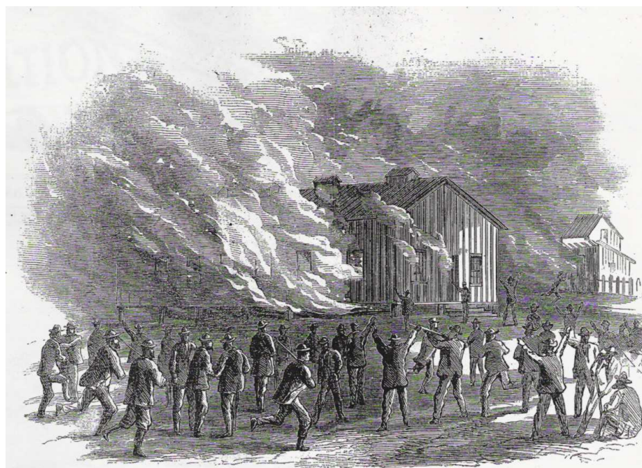
Figure 1: "Burning a Freedmen's School-House"

burning of a Freedmen's Bureau school, while about forty white men cheer and discharge