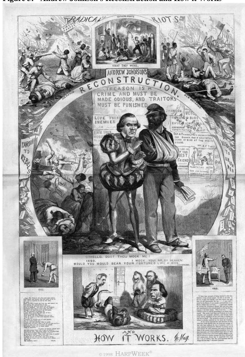
Figure 3: "Andrew Johnson's Reconstruction and How it Works"

Thomas Nast's cartoon in the September 1 issue of Harper's Weekly (figure 3), which prominently featured the Memphis massacre and the deficiencies of presidential reconstruction, exemplified the characteristics of Nast satire. Nast titled the cartoon "Andrew Johnson's Reconstruction and How it Works" and loaded it with layers of commentary, sometimes explicit and sometimes subtle.