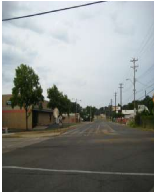
Figure 3: The Meeting Tillman Avenue and Broad Avenue (July 2010)