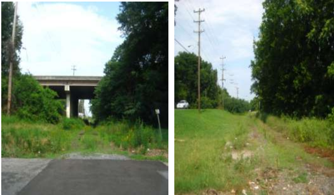
Figure 6: North Memphis/Chelsea Avenue Greenline

The North Memphis/Chelsea Avenue Greenline is currently an abandoned railroad owned by the Union-Pacific Railroad Company (Figure 6). This summer, efforts have been made to connect with a viable community in the area, but nothing has come to fruition, according to Syd