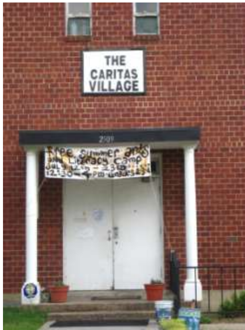
Figure 4: Caritas Village

of burglary, a slight decrease from the previous summer. 90 Many people have recognized the area's potential for change. Montague said it began with extensive community outreach efforts by repairing homes and creating life skill classes to keep the population off the streets. Home repair initiatives were the overreaching focus, in order to help clean the area up and separate it from its "high-crime" reputation, as Montague called it. This cohesive community support is evident in the charming Caritas Village (Figure 4), a restaurant community center that sits at the heart of the Binghampton neighborhood, described as a "100-year-old neighborhood on the edge of Midtown." 91 While driving through the neighborhood, one can see the changes the community is creating, including the installation of an urban garden and plans for a farmer's market in the fall of 2010. 92 These kinds of amenities arise from community leadership and grassroots efforts, the kind of dedication needed to create a greenline.