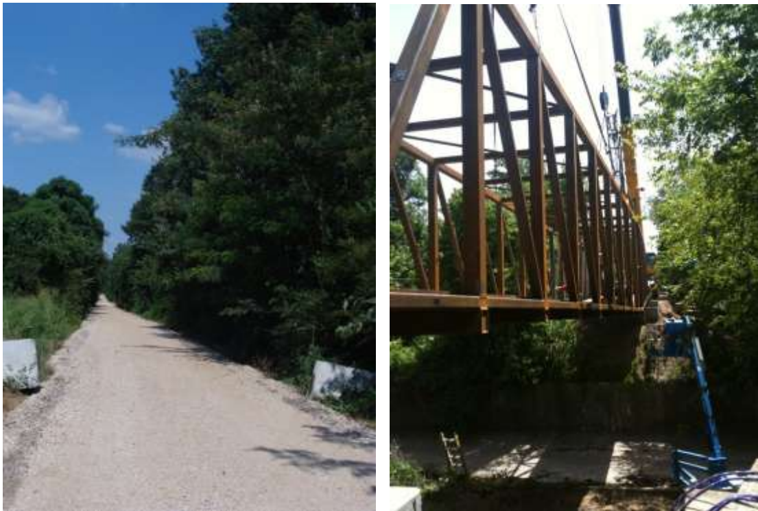
Figure 2: Section of the near-completed Shelby Farms Greenline (a) and construction on the Cypress Creek Bridge (b) (July 2010)

The Shelby Farms Greenline began as a cohesive effort by several environmental groups in Memphis under the umbrella organization Greening Greater Memphis. These environmental groups included Greater Memphis Greenline, the Shelby Farms Park Conservancy, and the Wolf River Conservancy. The primary advantages of the Shelby Farms Greenline are its strong community leadership and its quick acquisition of funds. The greenline project had been on the