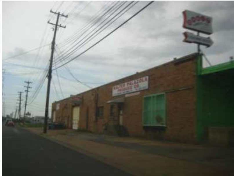
Figure 5: Scott Avenue