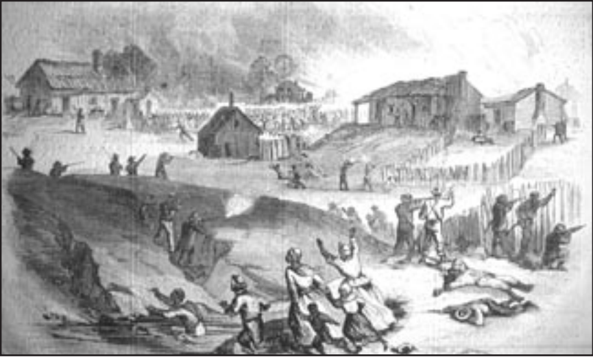
These scenes of the Memphis Riot of May 1866 were published soon afterward in Harper's Weekly , a popular nineteenth-century periodical. Such images helped galvanize northern public opinion against the Memphis rioters.