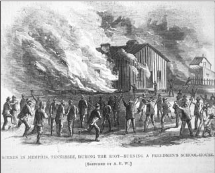
Above: Newly freed former slaves flee from attacking whites. Below: Rioters burn a schoolhouse for freedpersons.