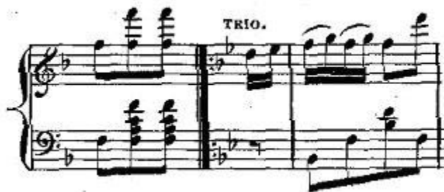
Example L: Christopher Philip Winkler, Lily Gallopade , (Philadelphia, Pa.: A. Fiot, 1851), mm. 34-35.

A few stylistic exceptions in Winkler's compositions are the frequent use of complete dominant seventh chords most often in root position. Winkler often uses the thick texture of a full seventh chord in the Waltz. Example A, measures two and three show this trait. This also suggests that Winkler had large hands that were capable of playing virtuosity. The dominant seventh is also found as a third inversion with a missing fifth. This chord is seen in Winkler's compositions and is commonly used by other composers at this time. This characteristic creates a slight dissonance in the accompaniment by accenting the major second between the root and seventh of the chord, while remaining in the principle key. This creates a strong cadential feeling, and Winkler uses this at half cadences. Final cadences are the only times other chromatic chords are used. There are only a few examples of French-augmented sixth chords and German-augmented sixth chords in his compositions.