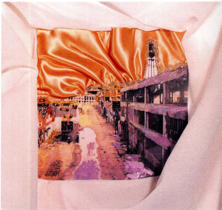
Whitney Sage, Ruin Porn Series II , 2010