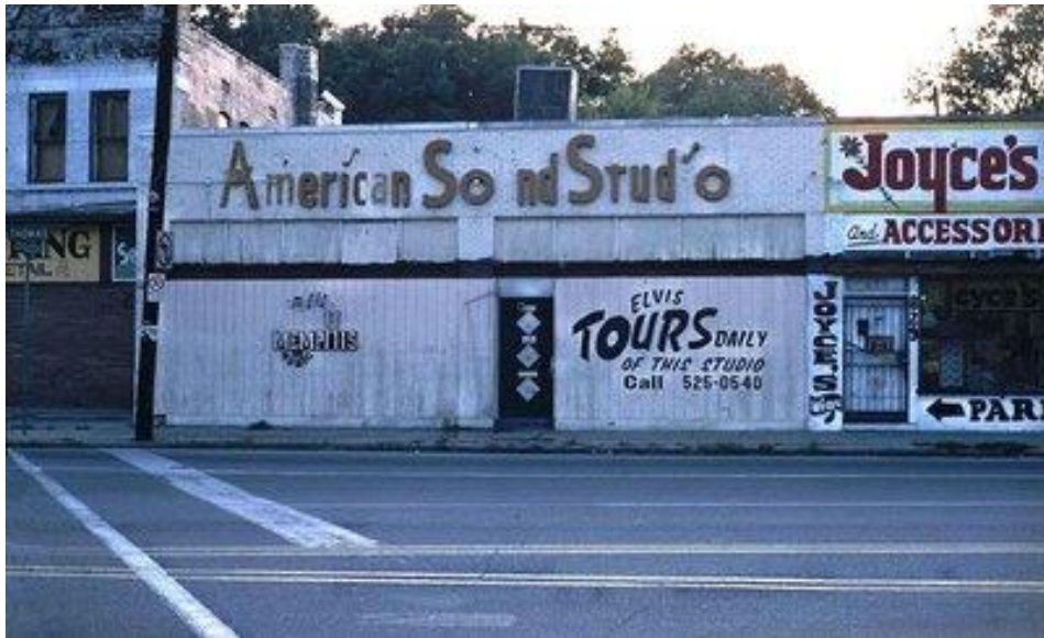
Figure 1: Picture of American Studios. Date unknown. 14