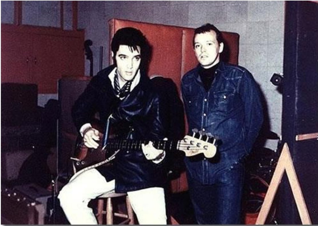
Figure 3: Chips Moman and Elvis Presley at American Studios. 40

The RCA producers and Tom Parker, realizing Chips was not going to back down, ran straight to Elvis, hoping to convince him to leave. Elvis, feeling rather pleased with the session, responded coolly with “I know you’re doing your job, but how about letting me and Chips handle the session.” 41 Seeing no alternative they were forced to allow Elvis to proceed with his work at American.