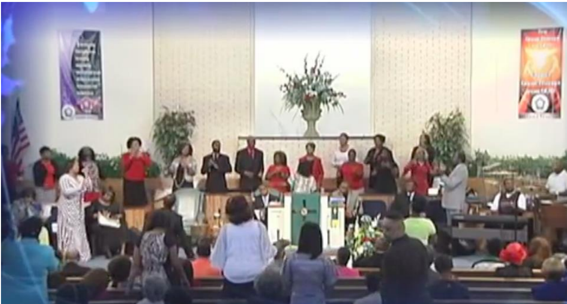
Greater Harvest COGIC Sanctuary 28

the right, with crosses and potted plants lining the front of the sanctuary. While The Stirring may feel like “a concert you attended recently” in the sense that you can watch a band perform songs, the music at Greater Harvest reminds you that at most concerts, there are people. And those people like to have fun. In addition to congregates prophesizing, speaking in tongues, and falling out, 27 I saw some of the most impressive dancing in four-inch heels I could imagine. While mothers and elders were running around the church and dancing in the aisles, it was obvious that some spirit—or whatever you wish to call it—was alive and well in the sanctuary. As a woman assured me when I was walking into the church, “don’t be frightened by anything you see honey, we’re just here to have fun and worship Jesus.”