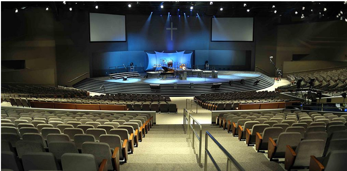
The bottom two levels of the three-leveled sanctuary at Hope Pres 7

the only indication that this is a religious space. A fifteen-piece praise and worship band is the focal point of the space and the services at Hope. Their performance, which accounts for about 80% of the service, is accented by a sophisticated light show and multiple cameras which project onto two 25'x14' screens. According to Hope's website, "it takes 8 volunteers and 3 staff to run video and lighting on a given weekend." 6 Also on Hope's campus is a state-of-the-art recording studio, The Grove, that has recorded Darius Rucker and multiple Dove Award winners (think Christian Grammys). Needless to say, music is a large part of Hope's ministry.