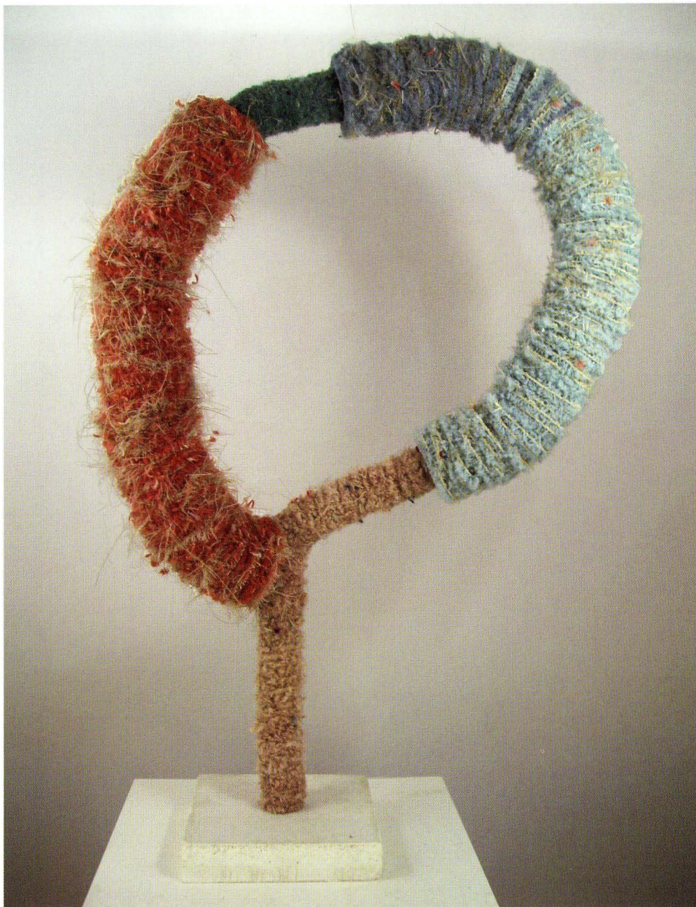
Pencilneck , carpet, metal and stone, 40" x 27" x 10", 2008