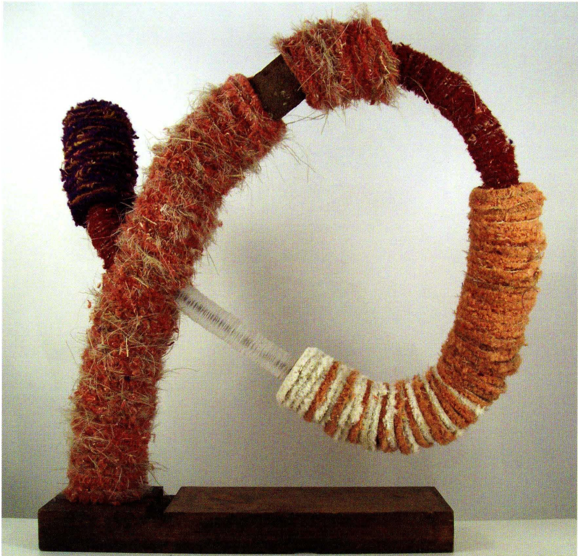
Roller , carpet, metal and wood, 30" x 31" x 7", 2008