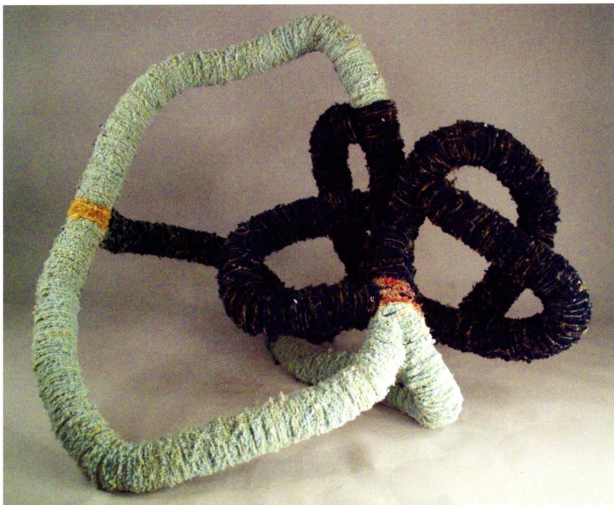
Blue Heart , carpet, metal and wood, 46" x 56" x 48", 2008