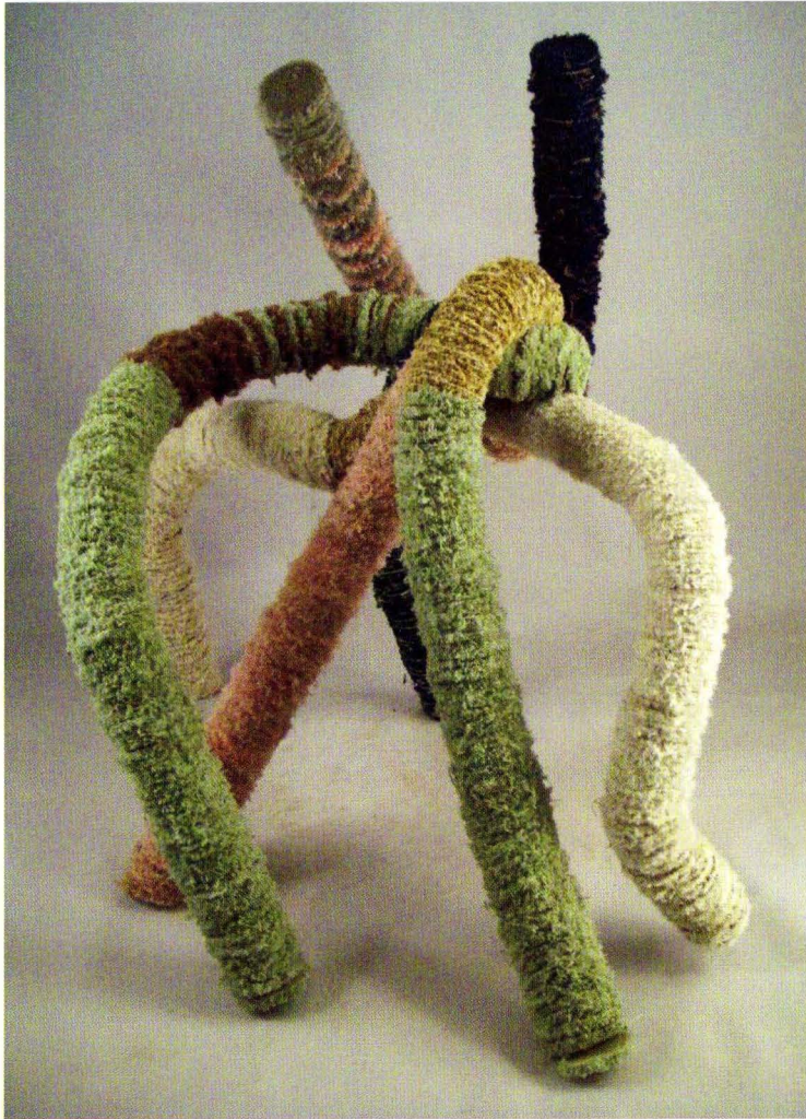
Grapple , carpet and metal, 56" x 60" x 44", 2008