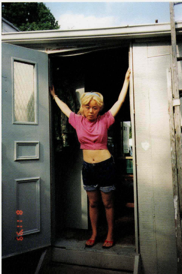
The Ohio Project (8) , Fujiflex print, 28.25" x 21.5", 1999