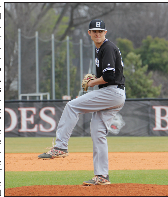
Rhodes vs. Webster earlier this season.