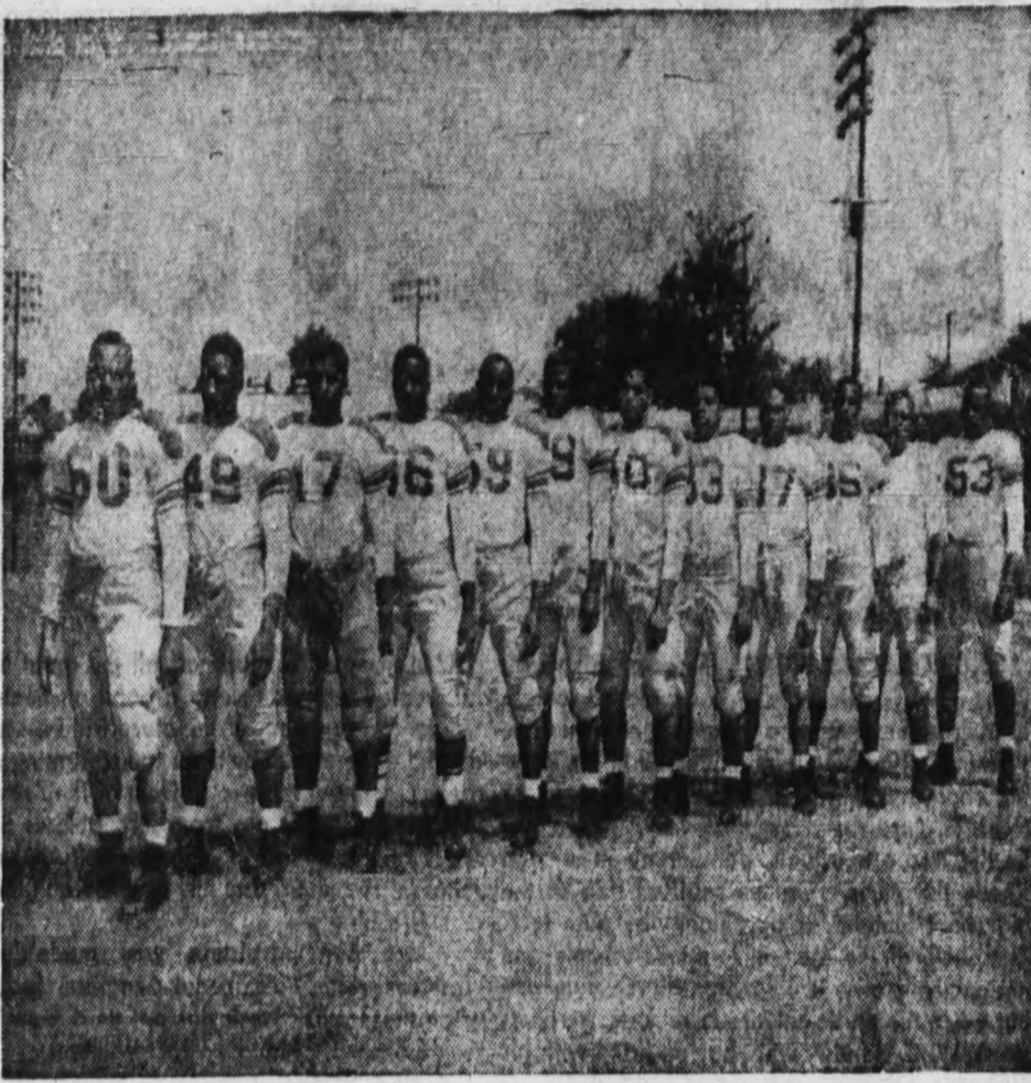
MORRIS BROWN BOASTS GREAT ARRAY OF BACKFIELD TALENT—Morris Brown will carry one of the best balanced backfields in sepia college football to Tyler on December 9, when they tackle the Texas College Steers in a big intersectional classic.

March 3, South Carolina State, Orangeburg, S. C. Date to be worked out with Alabama State in Montgomery, Ala.