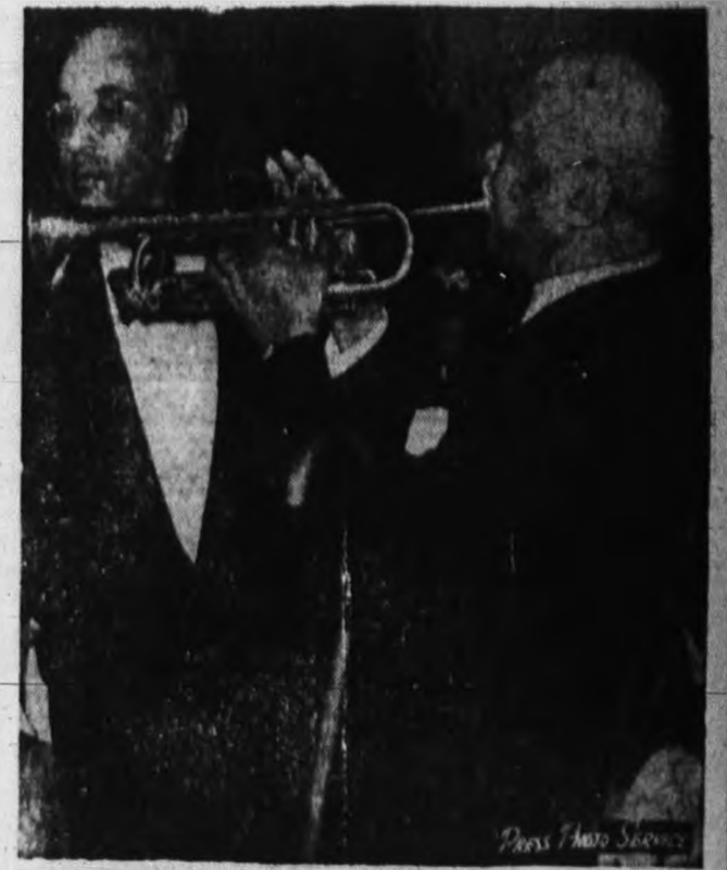
WILLIAM CHRISTOPHER HANDY, shown in one of his characteristic poses as he plays the "Beale Street Blues" on his golden trumpet. He will be featured guest tonight during the 12th annual Blues Bowl Classic at Melrose Stadium.