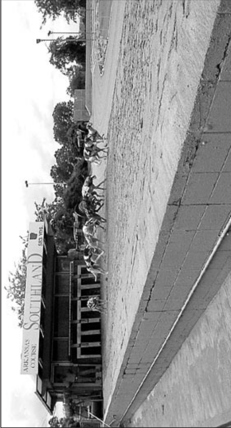
Southland Greyhound Park in West Memphis, Arkansas, which opened in 1955, serves as an example of Arkansas's heritage of legalized gambling. Although attendance has fallen off in recent years at Southland and at racetracks across the country, the park's long existence makes it all the more difficult to understand why the state has failed to enact further legal gambling, such as casinos or a lottery.